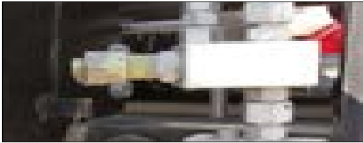
End of cable/ hook upper position automatic movement stop