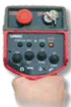
Radio remote control