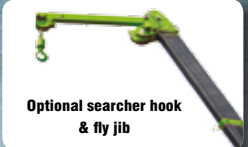
Optional searcher hook & fly jib