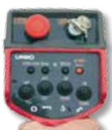
Standard radio remote control