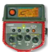
Optional radio remote control with digital feedback